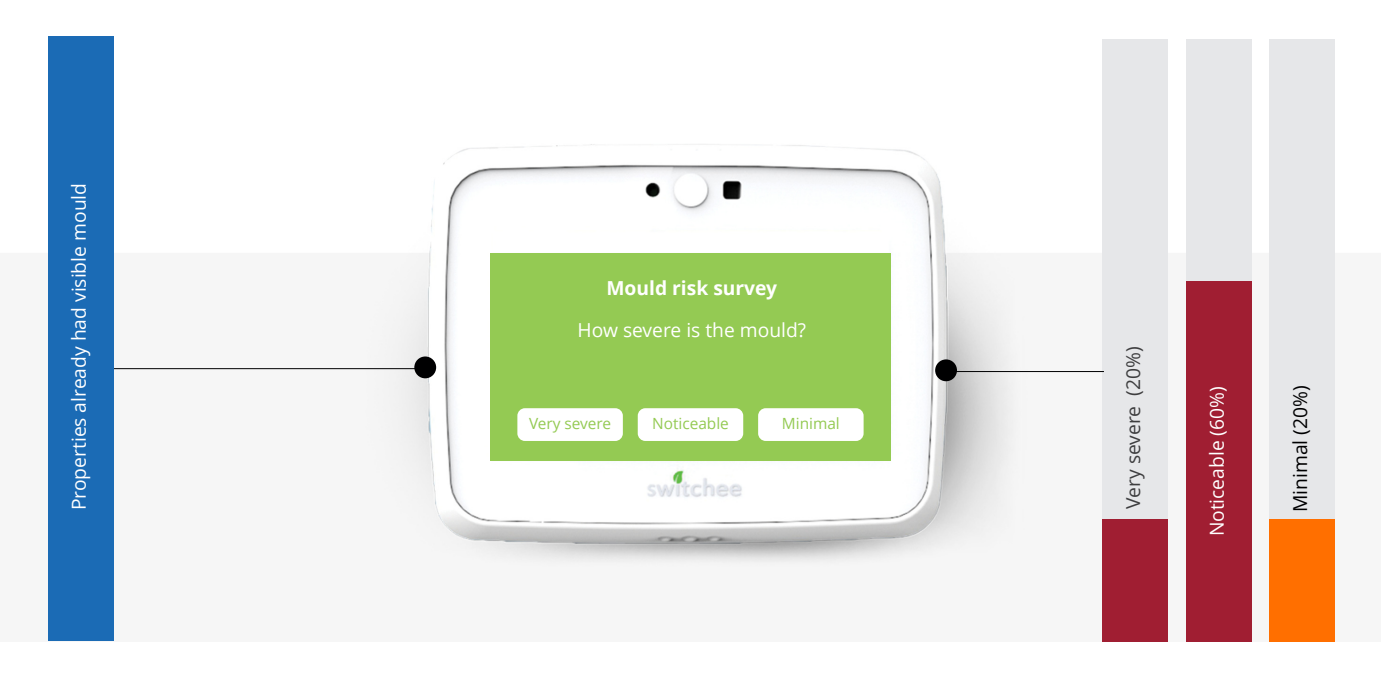
Fig 1.2 Mould risk survey

Surveyors can be informed of problems early – before both the cost of repair and the potential health impact on residents increase dramatically.